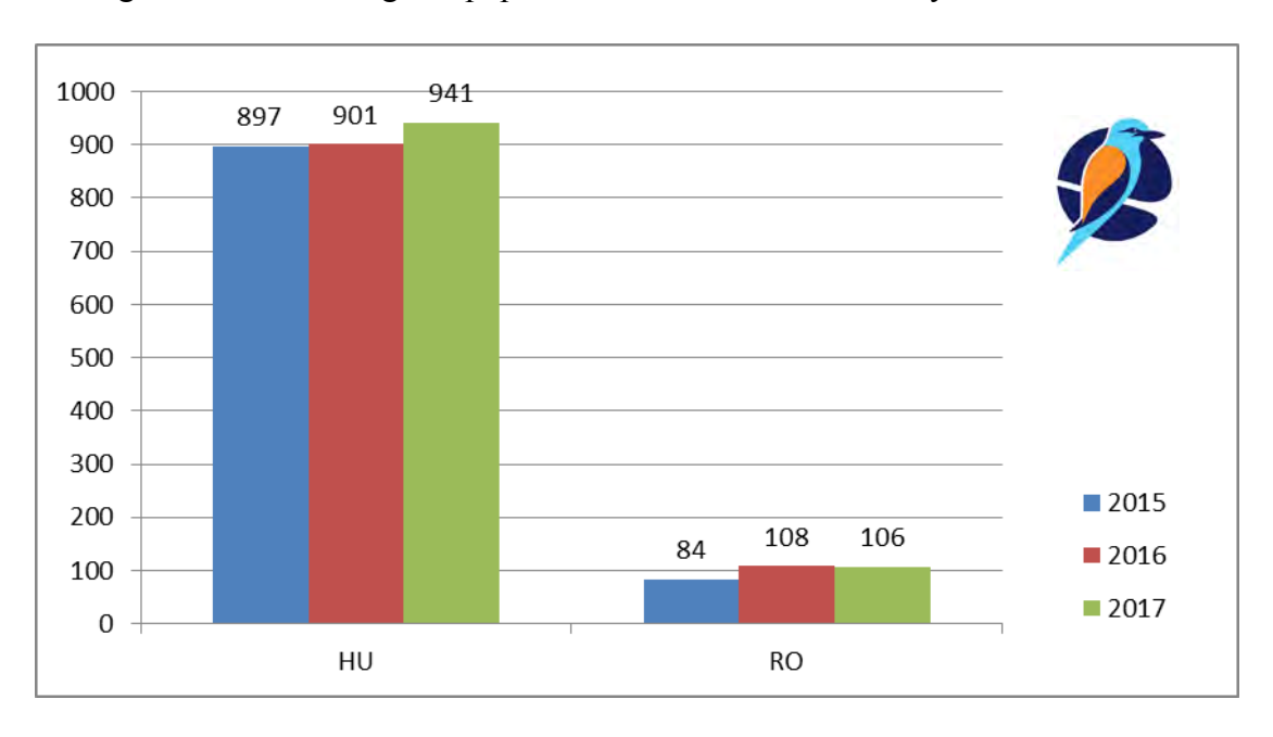
Table 1: number of Roller pairs of the project sites in 2015, 2016 and 2017

The evaluation of project efforts in this relatively early stage is not entirely possible, however as this diagram shows the targeted population seems to show stability in numbers.