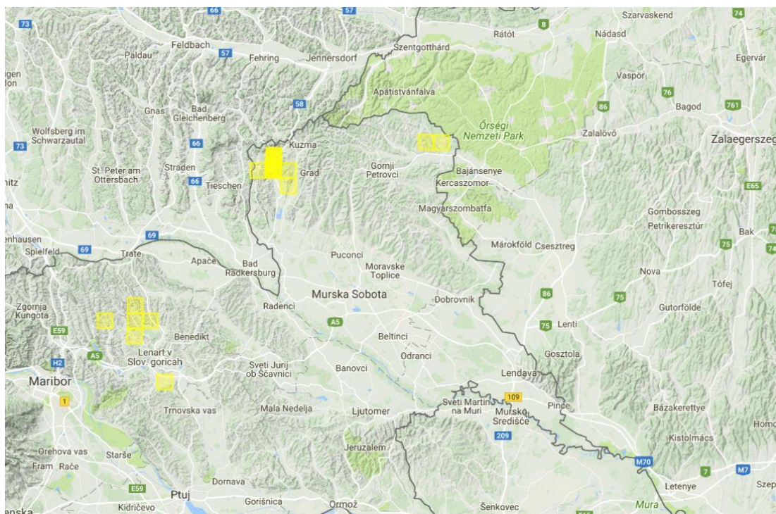
Map 1: Data of Roller observations in breeding season in main priority areas for Roller in Slovenia; Google Maps (NOAGS; BirdLife Slovenia 2016).