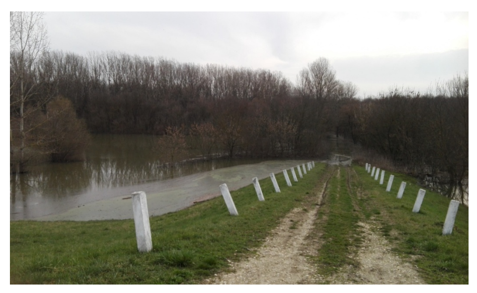
The project site in February 2016

At the end of the plantation works (2016 spring) totally 96 500 pcs of saplings will be planted. The rest of the planned number (86 300) of saplings serves as replacement in the future in accordance with the weather conditions and the development of the planted saplings. For the details (regions, area sizes, sapling species etc.) see annex C3_2.